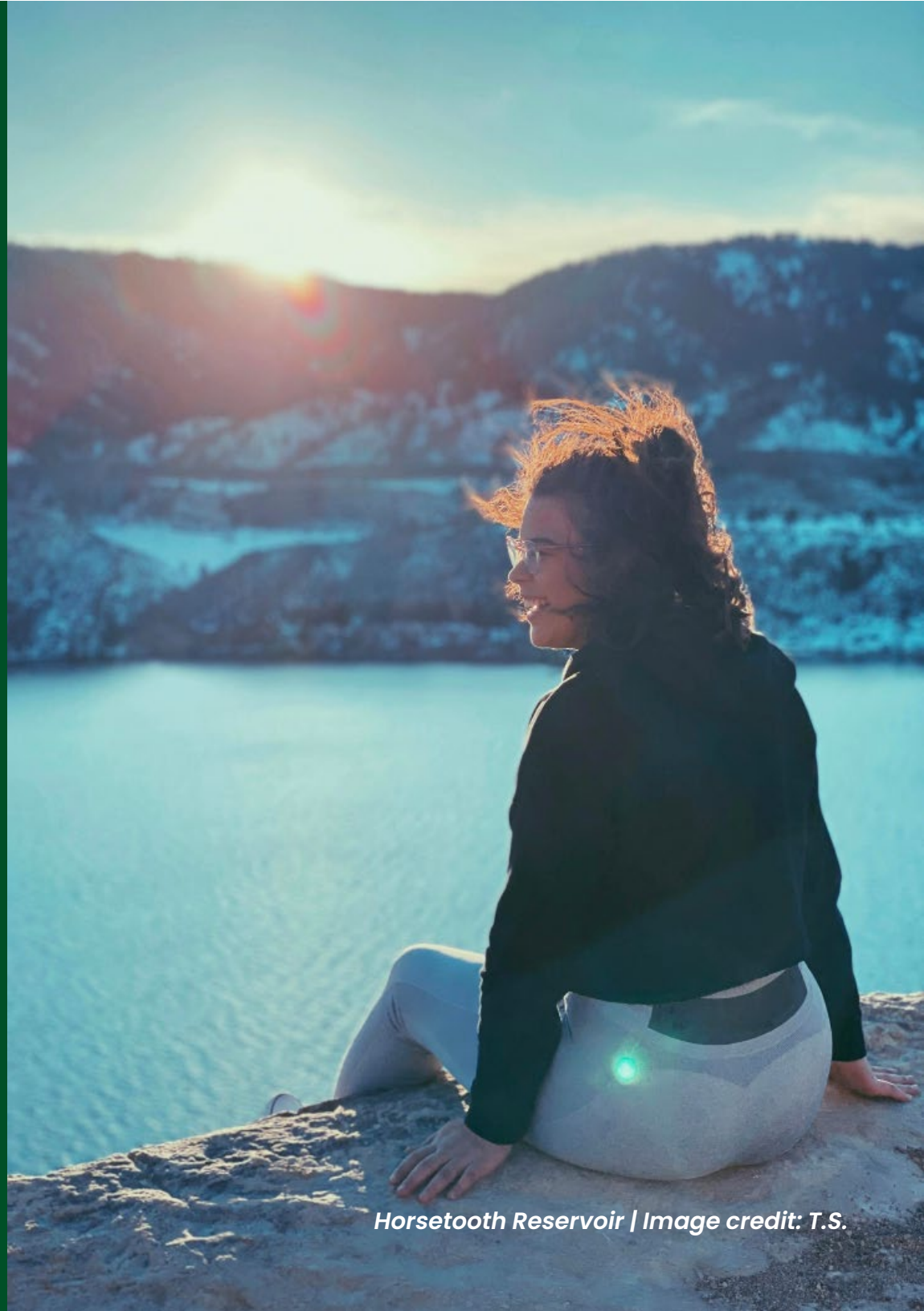
Horsetooth Reservoir

It runs through Fort Collins and is Colorado’s only nationally designated ‘Wild & Scenic’ river! The river got its unique name when French-Canadian trappers were forced to hide their gunpowder during a raging blizzard in the early 1800s.